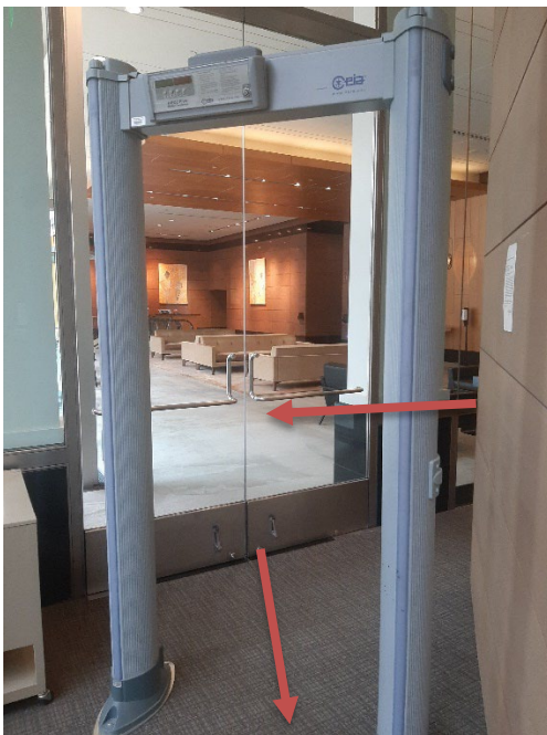
The security entrance with 2 directions to monitor.