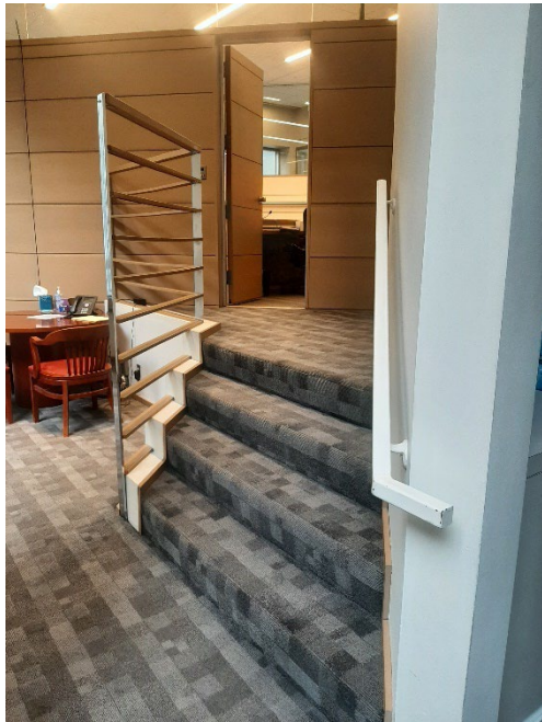
The only access to the judges' bench.